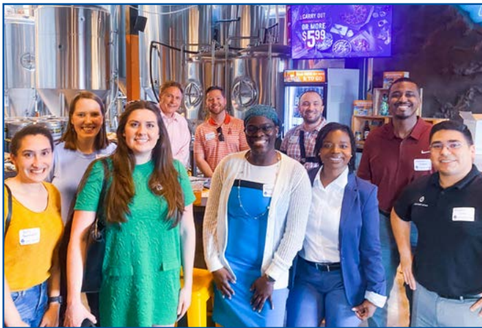
Post Busy Season Happy Hour at Buffalo Bayou Brewing on May 4