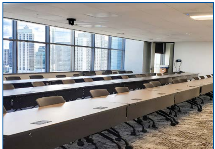
High Tech Training Room