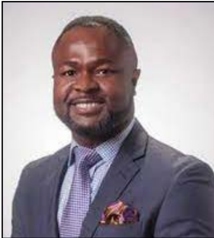
CKO CPAs & Advisors Managing Director