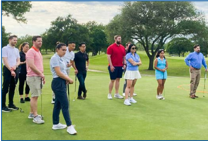
Swing into Summer Golf Workshop at Sugar Land Country Club on April 26