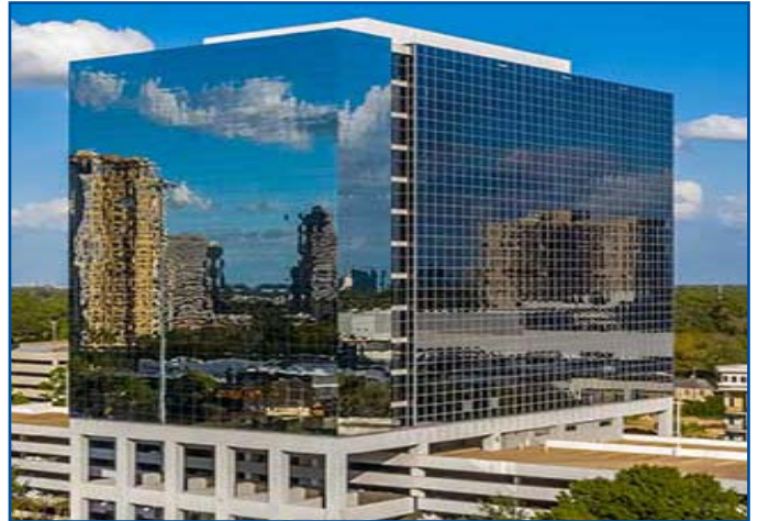
Park Towers | 1233 West Loop South, Suite 1425, Houston, TX 77027

Registration not required! Save the date and we'll see you on July 12!