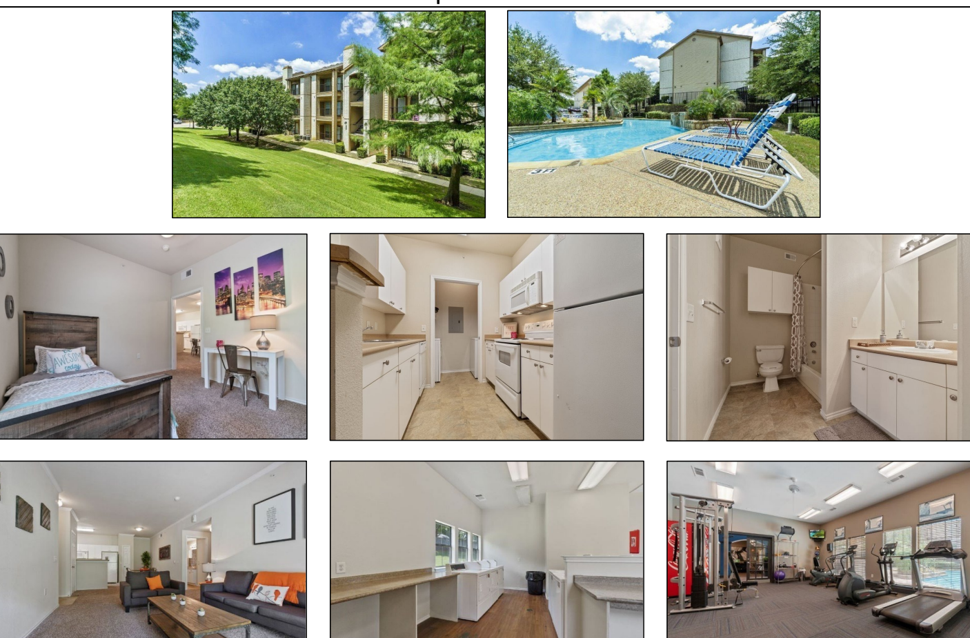
WELCOME TO WINDSONG APARTMENTS... brand new spacious apartment homes nestled quietly just south of I-30. This distinctively designed community is perfect for today's busy lifestyle. You'll be minutes from everything the metroplex has to offer. Your 1, 2 or 3 bedroom home will be complete with all the features you would find in a luxury home. Enjoy our clubhouse with access to our business center and fitness center. There's only one place to live....Windsong Apartments.

Address: Windsong Apartments - 1600 Cooks Ln, Fort Worth, TX 76120